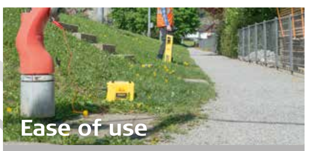
DD SMART utility locators offer an easy-to-use tracing system which delivers high accuracy results without complication.