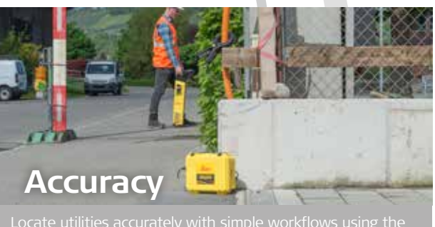
ocate utilities accurately with simple workflows using the atest digital technology.

Trace utilities with confidence in environments with high utility density and complexity.